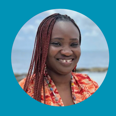
Using smartphones, U of T PhD candidate works with Nigerian women to protect communities