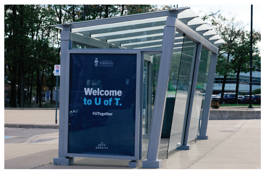
A transit shelter ad on the University of Toronto Scarborough campus for the back to school campaign in 2022.

The brand hub team also produced sponsored content that appeared in The Guardian, The Hill Times , Pearson and Billy Bishop airports, The Globe and Mail, Strategy Magazine and Marketing News Canada , and digital and social media channels. The campaign, which promoted our incredible community of researchers, students, and alumni, received more than 100 million local and global impressions in digital and social channels, including The Guardian , Yahoo, Facebook, Instagram and LinkedIn. The campaign also featured banners, transit shelter ads, digital signage, videos and other content around our three campuses promoting those who are defying gravity in their fields.