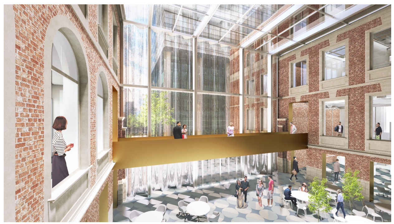
FitzGerald, showing the proposed Atrium space from 1<sup>st</sup> floor, looking east towards Leslie Dan Pharmacy Building