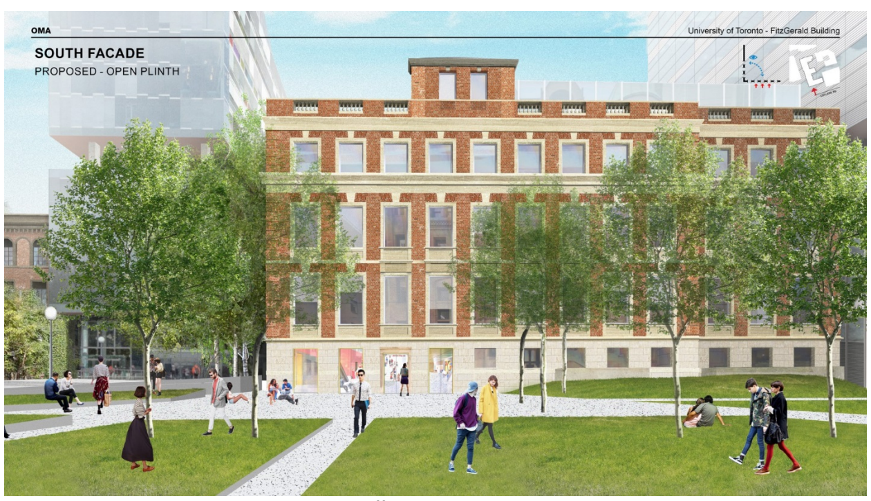
FitzGerald, showing the proposed South Façade off College Street. Note: the windows shown in the rendering propose single pane, triple glazing. An alternative approach may include metal screens to introduce divisions into the windows.